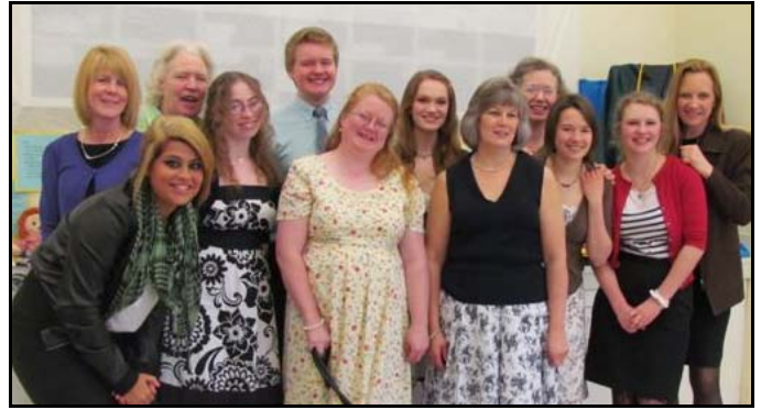
Sr. students and their moms at the Sr. Mom & Me Tea

Check on our website at www.cpcsschools.com/mlt